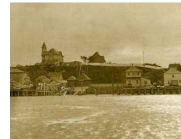
School B The school on Coast Guard Hill