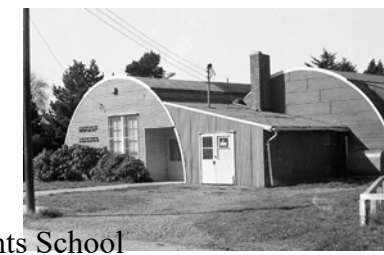
School D Bandon Heights School