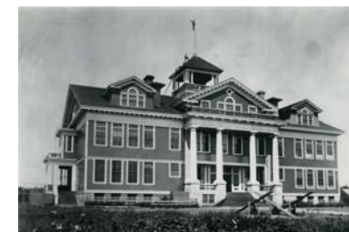
School A The Central School