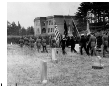
School C The Eastside School