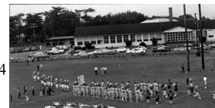
School E Bandon High 1950-1974